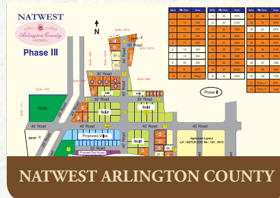
NATWEST ARLINGTON COUNTY