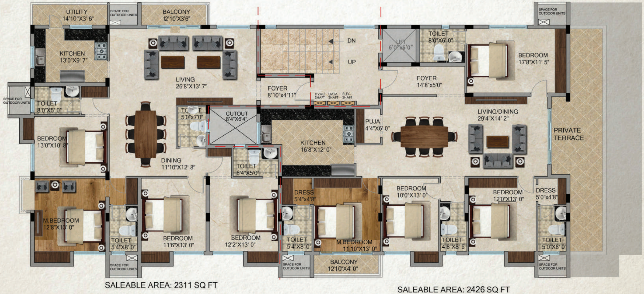
THIRD FLOOR PLAN (4 BHK FLATS)