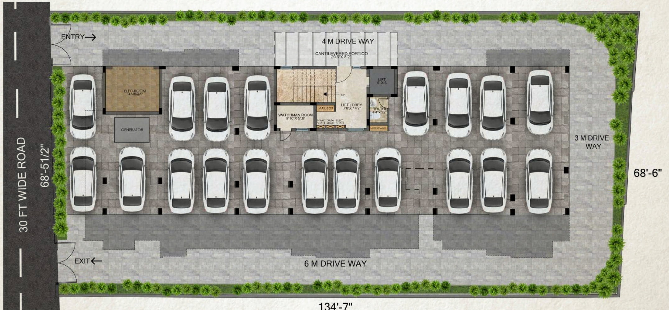
134'-7" SITE/STILT FLOOR PLAN (Practical Car Parking)