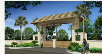
NATWEST MANGO COUNTY