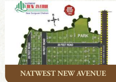
NATWEST NEW AVENUE